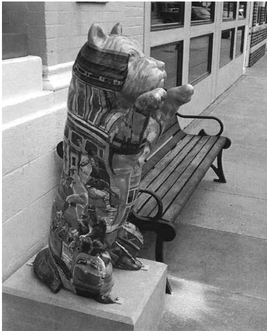
Toto "guarding" the Wamego City Office- 430 Lincoln Ave.

Look around and you will see that the Totos are here! Fifteen to be exact. These Toto figures were decorated by local artists and were installed in July all around Wamego, by Construction, Inc., upon limestone pedestals furnished by Higgins Stone. This completes the Wamego Convention and Visitor's Bureau public art project. Maps showing locations, and identifying the artists and sponsoring businesses can be picked up at the Chamber of Commerce office – 529 Lincoln Ave., and the Wamego City Office- 430 Lincoln Ave. They are also posted on the Visit Wamego website. Try to visit each one. Also, the Totos love having their picture taken— don't disappoint them!